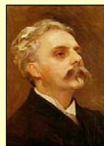
GABRIEL FAURÉ 1845-1924