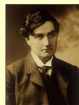
RALPH VAUGHAN WILLIAMS 1872-1958

June 14 Cibavit Eos Christopher Tye c. 1505-1573 CORPUS CHRISTI Missa Ego Flos Campi (a 8) Juan Gutierrez Padilla c. 1590-1664 SUNDAY Oculi Omnium Heinrich Schütz 1585-1672 Pange Lingua (a 5) Tomás Luis de Victoria c. 1548-1611 Caro Mea Verbo Est Cibus Matthieu Gascongne f. 1510-1525 Adoramus Te, Christe (a 8) Jacob Handl 1550-1591 Adoremus in Aeternum Gregorio Allegri 1582-1652